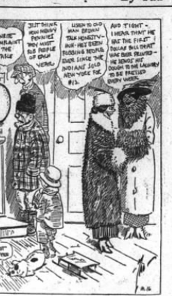
INDOOR SPORTS LISTENING TO THREE EGGS. THE GREAT GAMBLER IS THE WEIGHT MACHINES THAT DON'T WORK WHEN APPEAL. THE PENNY BOPPER.