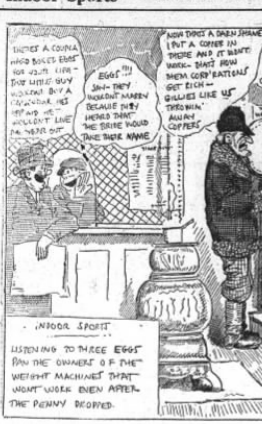
INDOOR SPORTS LISTENING TO THREE EGGS. THE GREAT GAMBLER IS THE WEIGHT MACHINES THAT DON'T WORK WHEN APPEAL. THE PENNY BOPPER.